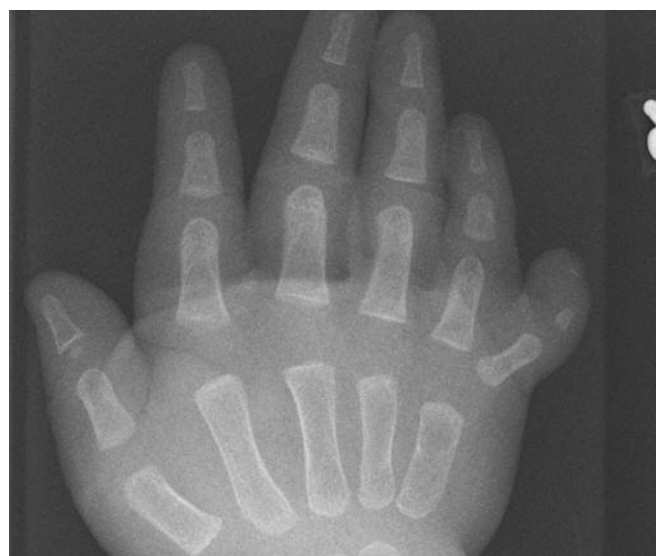
Polydactyly: a common congenital anomaly that plastic surgeons revise.