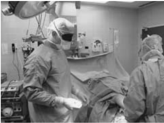
Figure 2. Can Surgeons be blinded?

words, there is the possibility that investigators in the majority of trials (59.5%) could identify the treatment to which their next patient would be allocated.